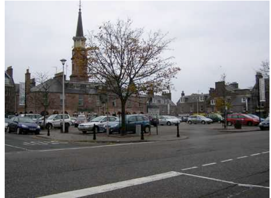
The Market Square in Stonehaven. This should be recorded as part of the Common Good of Stonehaven but Aberdeenshire Council deny the existence of any Common Good land in the town.