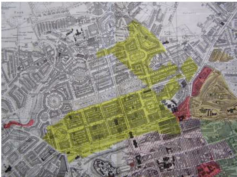
Map showing land acquired by Edinburgh Common Good Fund to construct the New Town (yellow), Common Good land of Calton Hill (brown) and Royal Burgh (red hatch).